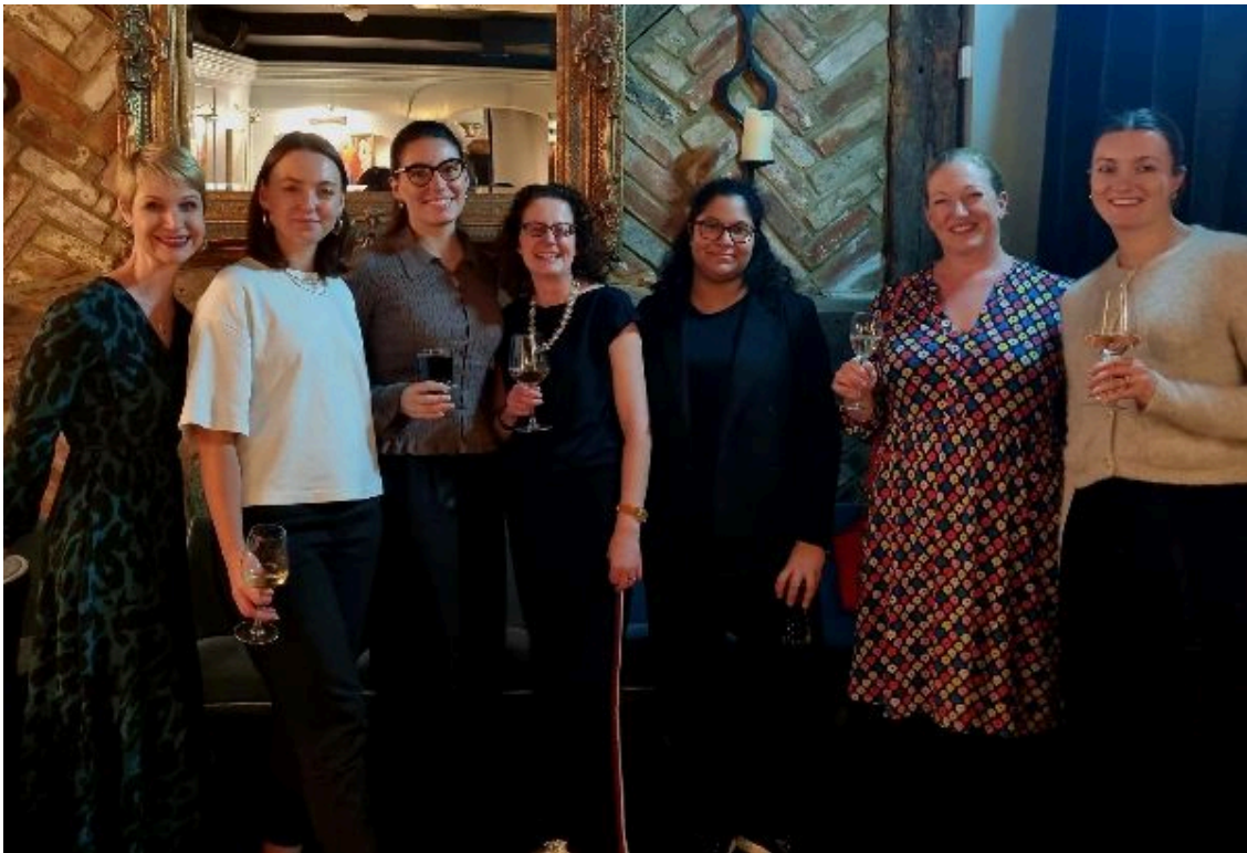
Thursday Fizz 16 October 2025

If you have any feedback or would like to be involved in the planning committee for next year's conference please get in touch. Look out for social media posts with photos from the event!